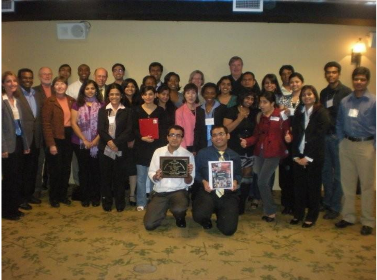
Students and Faculty from WKU's KPHA Conference

applauded Kentucky for various initiatives it has taken in the field of Public Health. He was also impressed by the number of students at the conference and referred to them as the 'New Workforce' in the field.