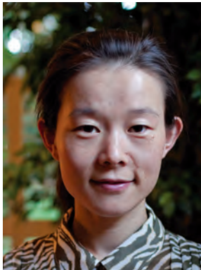
Qin Xiaoli Simpson Elementary Simpson County, Kentucky