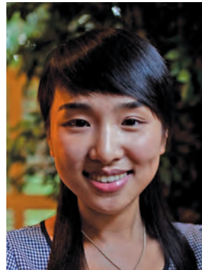
Tong Tong Chandlers Elementary Logan County, Kentucky