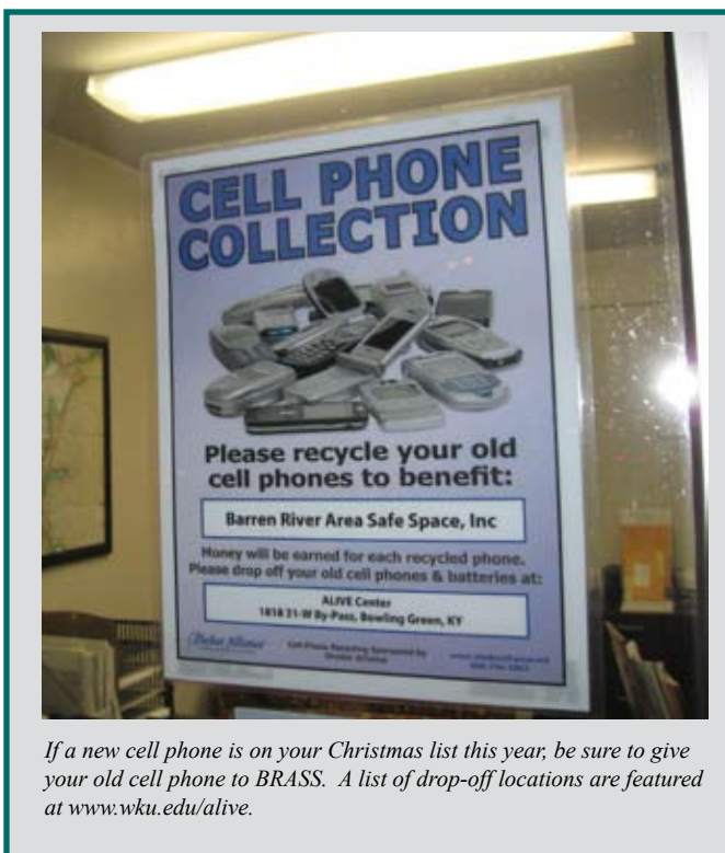
If a new cell phone is on your Christmas list this year, be sure to give your old cell phone to BRASS. A list of drop-off locations are featured at www.wku.edu/alive .

Please give us a call at 270-782-3162 to make arrangements for sponsorship or to make a donation to the Foster Grandparent Program. Thank you for your continued support of the Foster Grandparent Program.