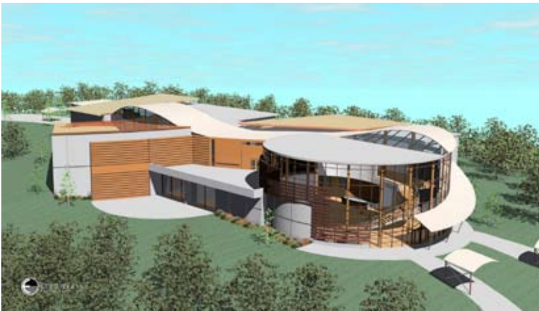
The architectural rendering above, created by Encompass Architects, features the new Kentucky Center for Native American Arts & Culture.