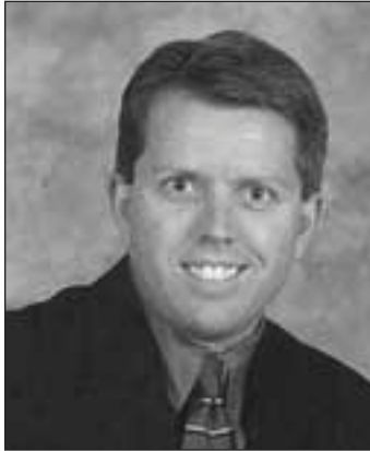
By Craig Cobane

Areté is not only the theme of this column, but also the title selected by the Honors newsletter editorial board as the name