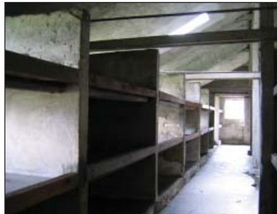
Clockwise from top left: Bunks in the building at Birkenau where Halina lived. Honors Director Craig Cobane rides a camel in Israel. ADL students have an emotional moment at Birkenau. Western and ADL students explore a photo exhibit at Birkenau.