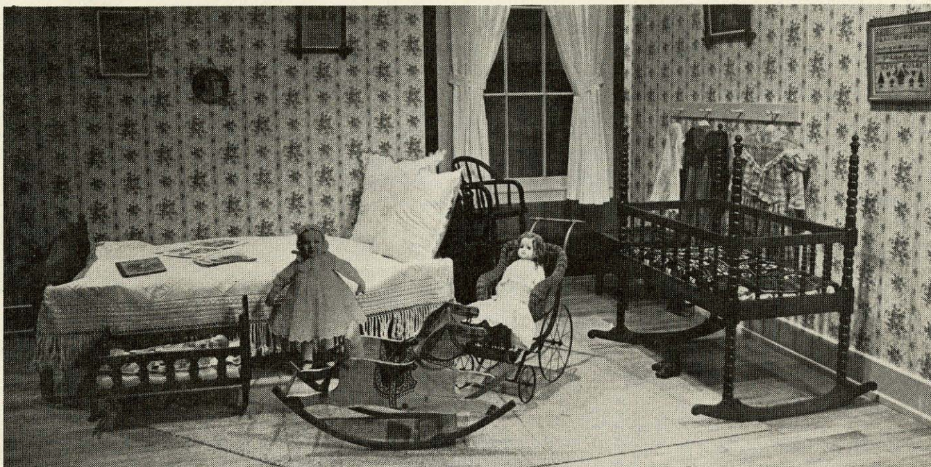
✓ CHILDREN'S BEDROOM SETTING, CIRCA 1900 "GROWING UP VICTORIAN: A KENTUCKY CHILDHOOD"

Vol.3No.9 of Bowling Green & Warren County Mar. 1983