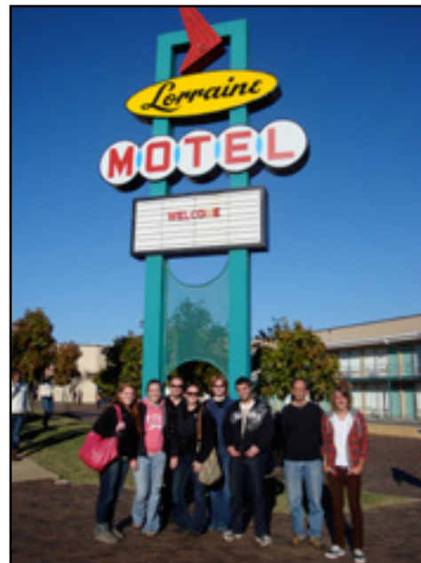
Students in the American Studies course visited the National Civil Rights Museum at the Lorraine Motel.

This experience was very educational and was made possible by the Honors College's support. Thanks to its funding, the class was able to make an inspirational journey.