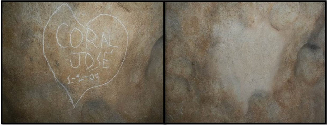
Figure 3: Graffiti and post-remediation efforts

has been developed and implemented over the last year. The two most prevalent destructive activities by visitors to Coronado Cave are littering and graffiti vandalism (Figure 3). Remediation efforts began in July 2014 with systematic removal and documentation of trash and graffiti. By April 2015, park staff, SCA interns, GeoCorps America interns and Boy Scout volunteers had meticulously scoured the cave and removed 45.53 lbs of trash in a total of 91.5 work and volunteer hours. Successful graffiti remediation by park staff occurred throughout the year using nondestructive techniques and materials.