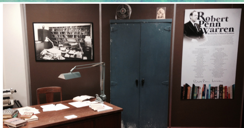
The late Robert Penn Warren is featured in newly interpreted space in the conference room, Kentucky Library.