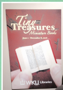
Tiny Treasures: Miniature Books exhibition is now open at the Jackson Gallery through December 8, 2016.