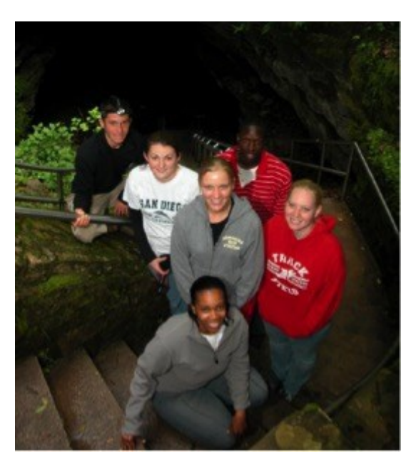
Figure 2. A recent group of WKU students at the Historic Entrance to Mammoth Cave.

"railroad fare, cave fare, and hotel fare to and from Mammoth Cave." An article from 1927 describing the benefits of such excursions to the cave (Figure 1) correctly claimed that "An education is not all derived from texbooks."