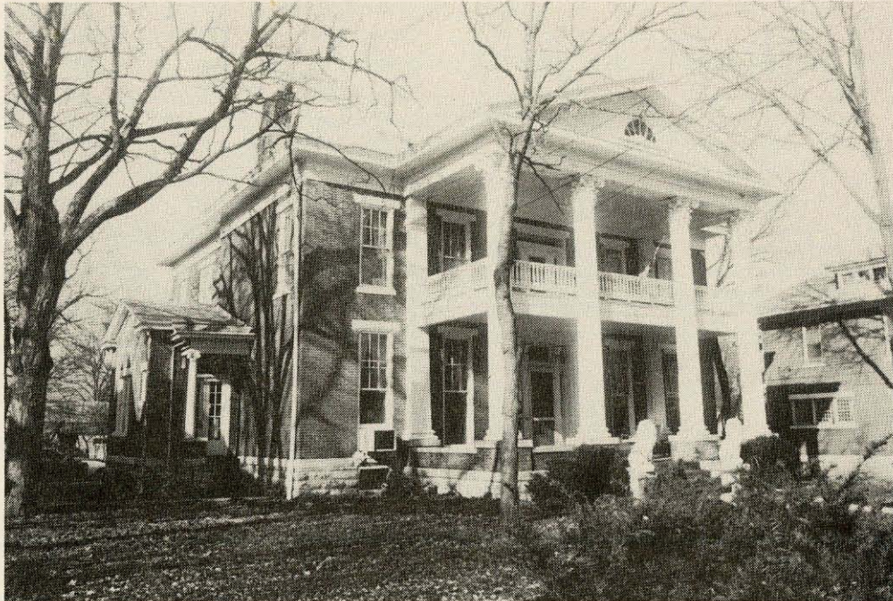
WILLIAM VOLTAIRE LOVING HOUSE 1253 STATE STREET CA. 1840