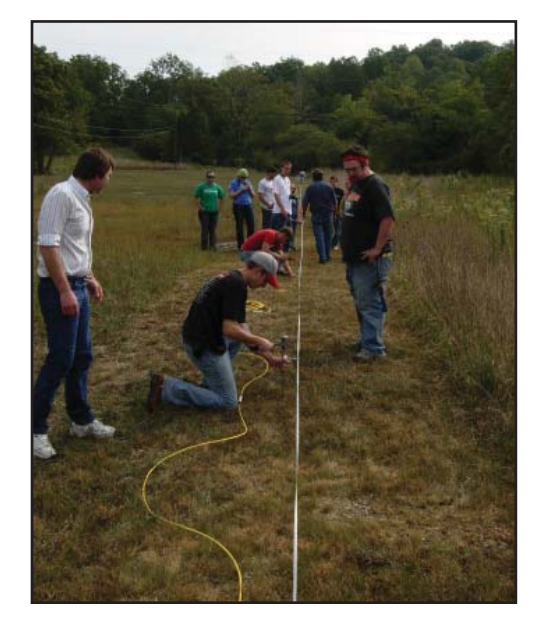
Figure 2. Wittenberg University geology students use Electrical Resistivity Ground Imaging to look for cave passages near the park.

research by state and federal agencies, nongovernmental organizations, private researchers, and numerous universities. MCICSL staff also assists the researchers in obtaining lodging, working with park staff and volunteers, and other logistical needs.