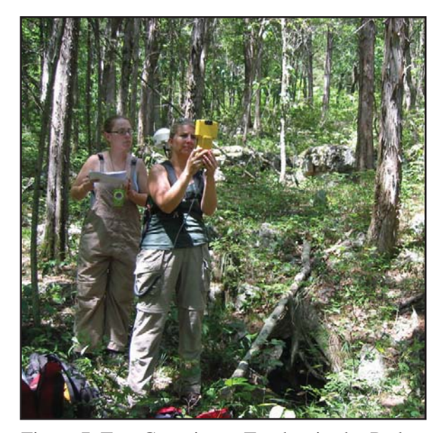
Figure 7. Two Geoscience-Teacher-in-the-Park interns assist park scientists by recording the GPS coordinates of a newly discovered cave entrance.

For the past three years, MCICSL has collaborated with Mammoth Cave's Environmental Education Division and the National Association of Geoscience Teachers to offer summer internships for local teachers. The teachers gain hands-on exposure to the variety