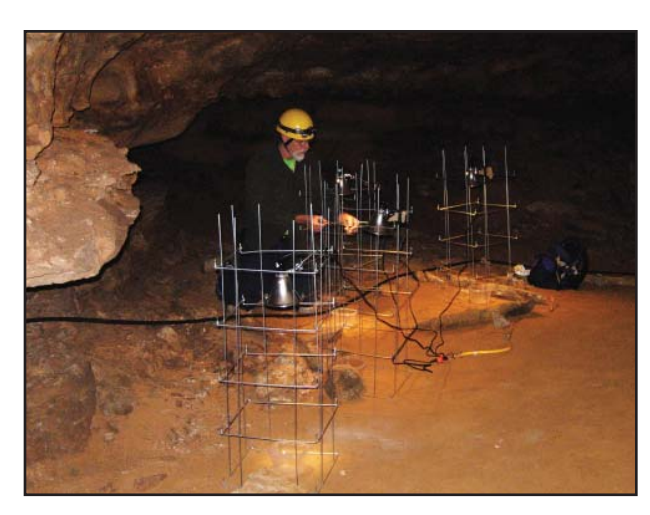
Figure 3. Mammoth Cave ecologist, Rick Olson, sets up an experimental apparatus to measure the amount of algae growth that occurs under different lighting conditions. MCICSL is co-lead on this project, which is also taking place at four other national parks.

MCICSL staff serves as the primary or coprimary investigator on several research projects involving NPS caves both within Mammoth Cave National Park and at other national parks. These projects include a multi-park lighting research project, research to address on-going E. coli issues in cave waters, and a project to improve monitoring of backcountry caves. MCICSL has also consulted with park management on various resource protection issues and assisted in relighting several areas of the cave to improve visitor experience and reduce exotic plant growth. During the summer of 2008, MCICSL co-hosted an intensive, weeklong Cave and Karst resource Management workshop at Sequoia / King Canyon National Park. This workshop was attended by cave resource managers from across the country.