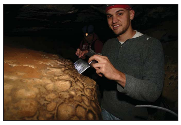
Figure 5. An Ohio State University geology student measures scallops to determine the speed and direction of the ancient cave rivers.

MCICSL provides a variety of research-based formal and informal educational and outreach opportunities to diverse internal and external audiences. Each year, numerous professors contact MCICSL to schedule customized research-focused field opportunities for their students. In addition to their work with students, MCICSL hosts, or co-hosts, science and research-based workshops for teachers and the general public. MCICSL also produces written internal and external research summaries and is serving on the exhibit committee for Mammoth Cave's new Visitor Center.