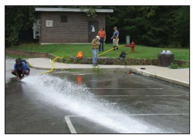
Figure 1. Tennessee State University students test the parking lot filter system in preparation for a larger project looking at parking lot runoff around Mammoth Cave.

MCICSL coordinates the research for Mammoth Cave National Park, including overseeing the research permit applications process. Through permitted research and research projects managed through agreements and other mechanisms, MCICSL facilitates