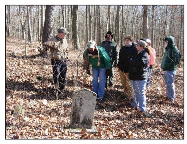
Figure 6. Participants in a weekend workshop visit the grave of William Bransford while learning about the history and contributions of African Americans to the Mammoth Cave area.