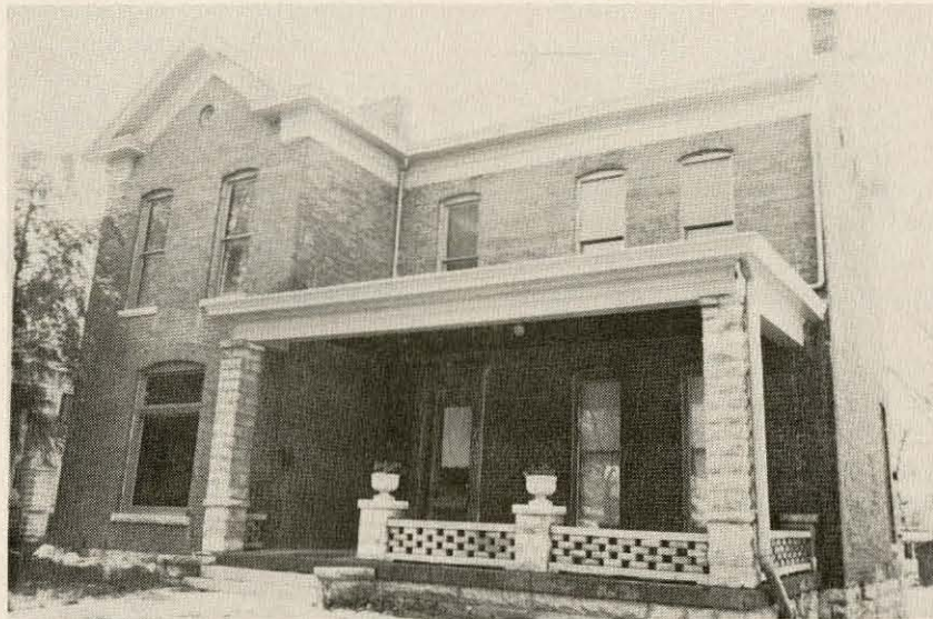
W.H. MITCHELL HOUSE 725 CHESTNUT STREET