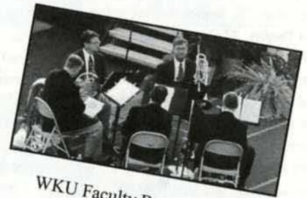
WKU Faculty Brass Quintet performs at graduation.

*cum laude **magna cum laude ***summa cum laude ****Potter College Scholar: 4.0 GPA