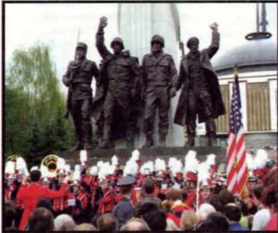
WKU Wind Ensemble in May in Moscow in front of the WWII monument at Poklonnaya Gora