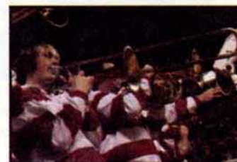
2005 Big Red Basketball Band