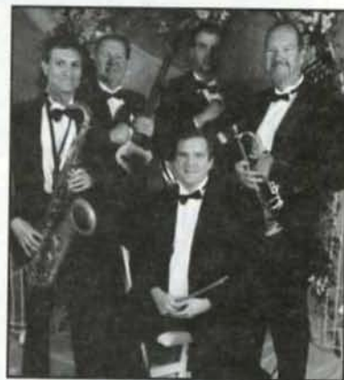
The WKU Faculty Jazz Quintet visited public schools in KY and TN throughout the year, were featured on the Jazz Band Concert at the Capitol Arts and performed for the WKU President's Gala in May.