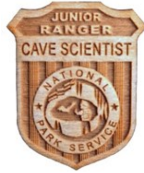
Figure 2 Junior Cave Scientist badge

Please help spread the word. These booklets are available to any group, school, grotto, or individuals for their use in helping educate the public about the values of cave and karst resources. Junior Cave Scientists pledge to explore magnificent and beautiful caves, to learn about caves and karst systems and the work that speleologists do, to protect our national parks and the things that make caves and karst areas special, and to enjoy the national parks and share what they have learned with their friends and family.