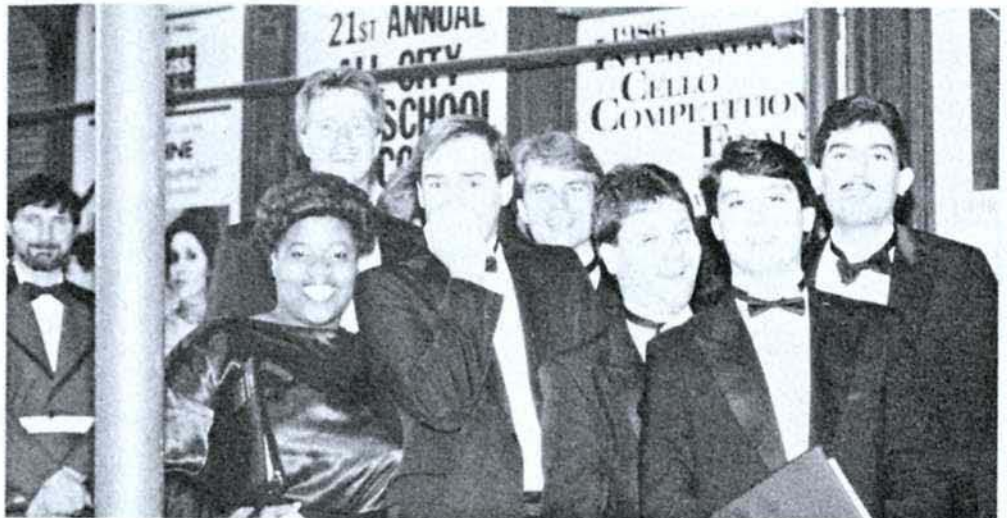
MEMBERS OF THE WESTERN UNIVERSITY CHOIR IN FRONT OF CARNEGIE HALL