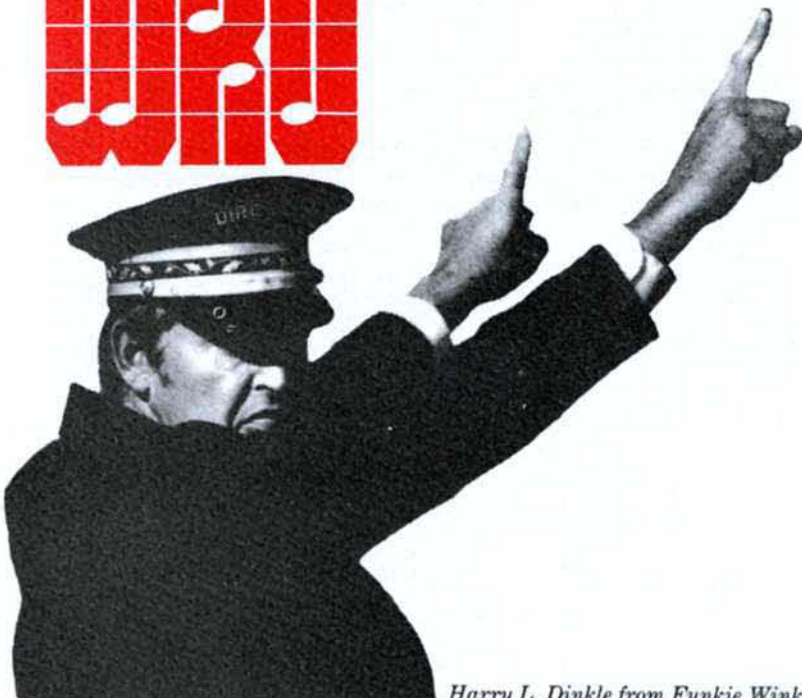
Harry L. Dinkle from Funkie Winkerbean?

NON-PROFIT ORGANIZATION U. S. POSTAGE BULK RATE PERMIT 398 BOWLING GREEN, KY. 42101