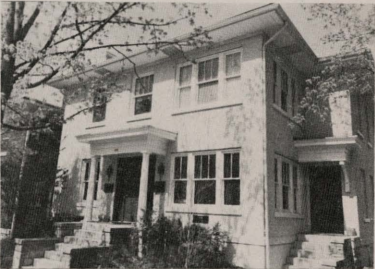
A.G. RUSSELL HOUSE, 548 E. MAIN.

A second floor apartment in the Arthur G. Russell House, 548 East Main Street, is now available for rent. Kitchen appliances, central air conditioning and heat, and off-street parking are included with this 1800 square foot apartment for $350.00 per month (plus utilities). For further information, please contact Mary Ann Kearny at 842-4148 during the day or 842-2330 in the evening.