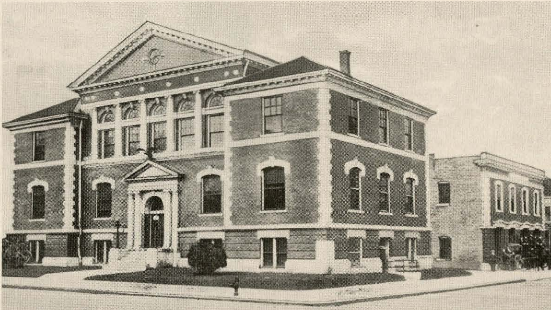
CITY HALL AND FIRE STATION CIRCA 1910.