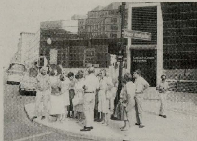
PARTICIPANTS ENJOYING SUMMER TOUR OF LOUISVILLE'S HISTORIC MAIN STREET AS A PART OF WEEKEND TRIP. HIGHLIGHTING THE TRIP WAS ATTENDING THE PERFORMANCE OF "A PRAIRIE HOME COMPANION" WITH GARRISON KEILLOR AT KY CENTER FOR THE ARTS.

Landmark's book, Architecture of Warren County , makes an excellent holiday gift. Special member price is $7.88 and it is available at the Landmark office, 914½ State