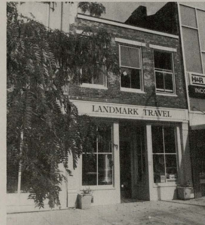
BARCLAY BUILDING - c. 1840-60 426 EAST MAIN STREET

Publicity and promotion of Preservation and Landmark was generated through several radio talk shows, television, and several items in newspaper.