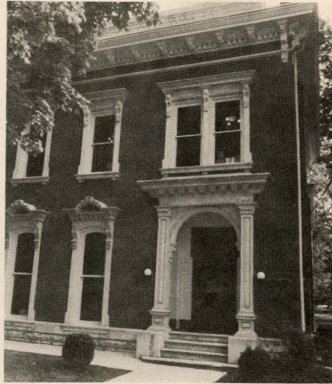
UNDERWOOD JONES HOUSE - c. 1875 506 STATE STREET

As you review Landmark's efforts of last year, please keep in mind that although we have already done a lot and come a long way in a few short years, we need your continuing support and assistance to maintain our momentum and strive to achieve even greater heights as we approach Landmark Association's 10th Anniversary next year.