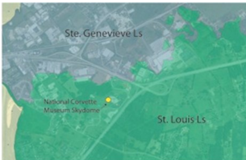
Figure 1. The Skydome is located near the contact between the Ste. Genevieve and St. Louis limestones on the Pennyroyal sinkhole plain. Data from the KGS Map Information Service.

During this time, Western Kentucky University (WKU) worked with the City of Bowling Green, Warren County, and the Museum to disseminate information to the public about the sinkhole. This included educating people that it is not uncommon for landforms like caves, sinkholes, and springs to be found in locations where many people live and thrive everyday. In fact, more than 6,500 sinkholes were reported in the United