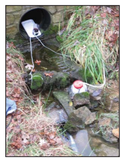
Figure 3: Photograph showing the dye and salt release mechanism. Also shown in the picture are the first flush sampler and the YSI datasonde.

first trickle; rather, it needed enough flow to lift it and destabilize it. At 3:00 A.M. on December 21, 2011, both tracers were released.