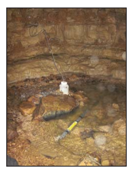
Figure 4: Photograph showing the pool at the bottom of Annette's Dome and the beginning of Shaler's Brook. Also pictured is the YSI datasonde with the first flush sampler.