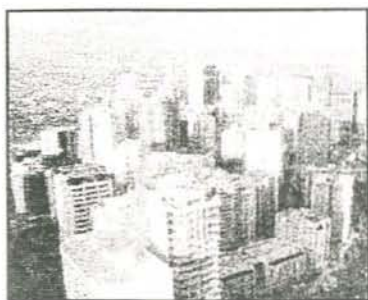
City of Manila