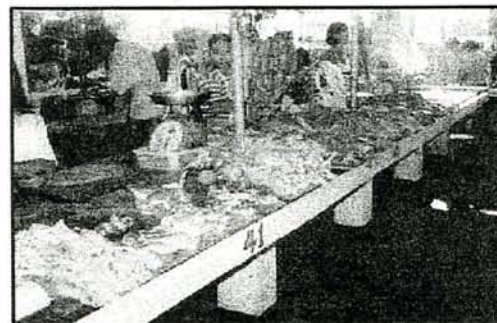
Meats at Market in Manila