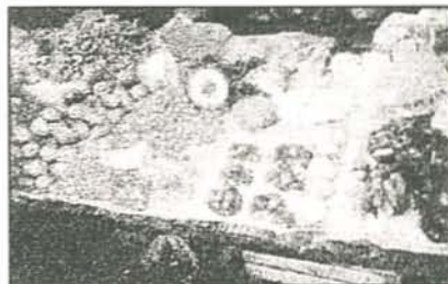
Food Items at Manila Market