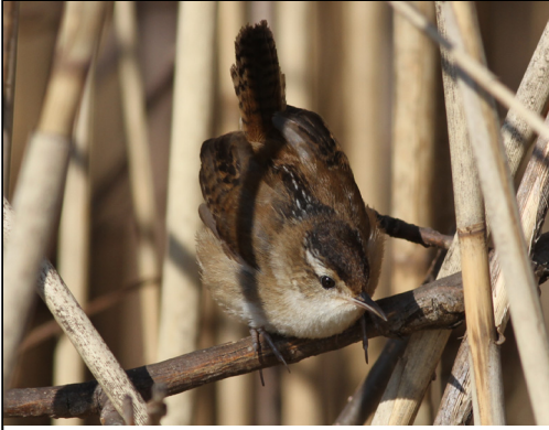
Marsh Wren, Muhlenberg 29 December 2013