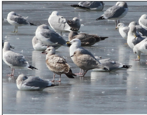
Iceland Gull (w/ Herring Gulls) Ky Dam Village 16 February 2014 Brainard Palmer-Ball, Jr.