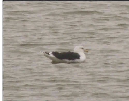
Great Black-backed Gull, Campbell/Kenton 2 February 2014 Eric Burkholder