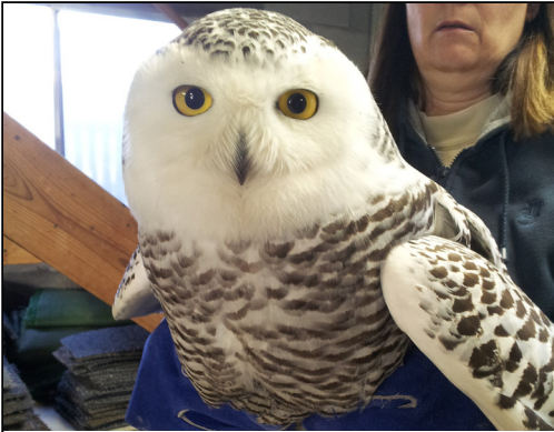
Snowy Owl, Jefferson 27 December 2013 Raptor Rehabilitation of Kentucky