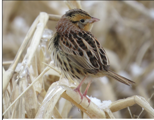
Le Conte's Sparrow, Fulton 8 February 2014