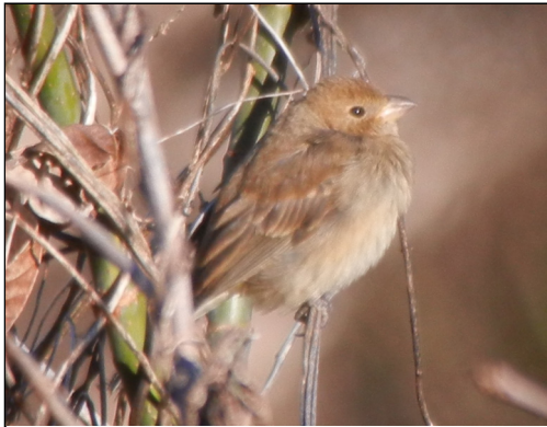
Indigo Bunting, Pulaski 1 January 2014 Roseanna Denton