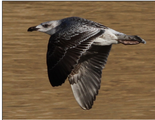
Great Black-backed Gull, Barkley Dam 24 December 2013 Brainard Palmer-Ball, Jr.