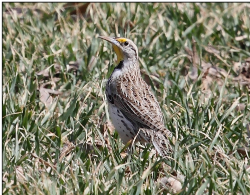
Western Meadowlark, Warren 23 February 2014