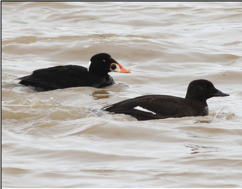
Surf Scoter w/ White-winged Scoter, Jefferson 9 February 2014