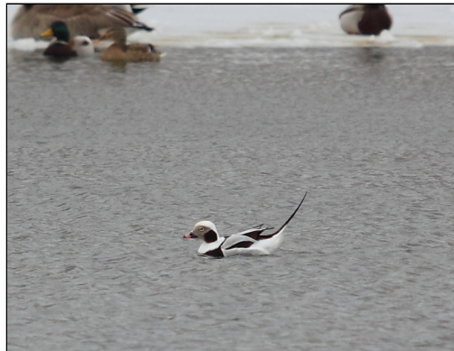
Long-tailed Duck, Franklin 5 February 2014