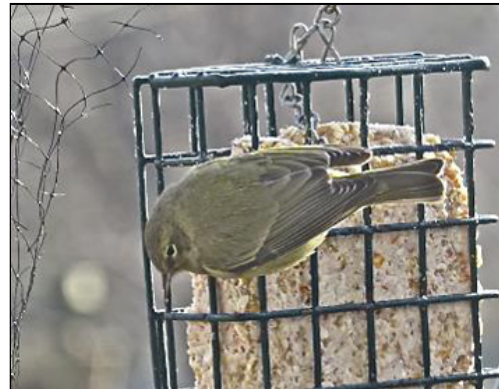
Orange-crowned Warbler, Calloway 28 January 2014 Rebecca Urban