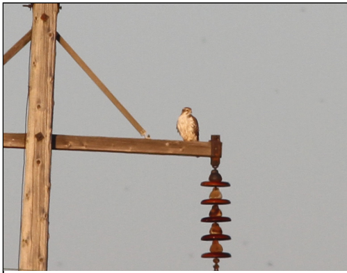
Prairie Falcon, Hopkins 16 December 2013