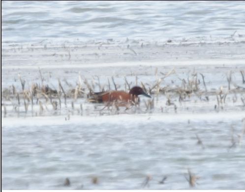
Cinnamon Teal, Warren 14 February 2014