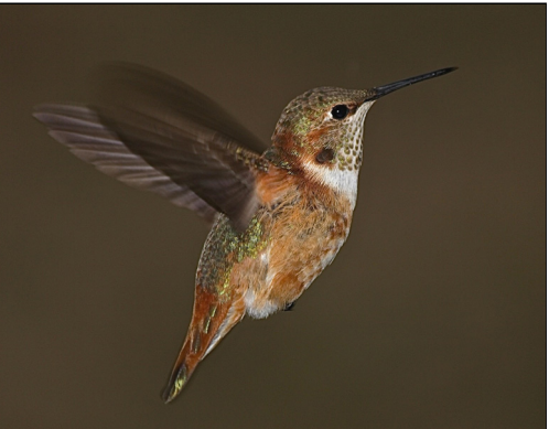
Rufous Hummingbird, Madison 15 December 2013 Caleb Fligor