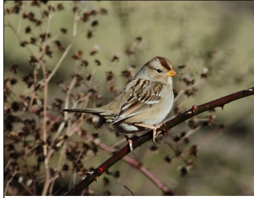
White-crowned Sparrow (Gambell's race), Lawrence 26 December 2013 Eddie Huber