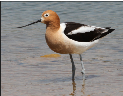
American Avocet, Hardin 25 April 2014