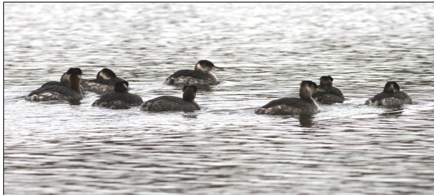
Red-necked Grebes (9 of 10), Jefferson 10 March 2014 Brainard Palmer-Ball, Jr.

Common Loon – 55-60 on Ky Lake, Marshall , 21 April (BP) represented a modest peak count for the season; singles at Ky Dam Village 13 May (AM) and on Barren River Lake 14 May (BP) were the latest to be reported.