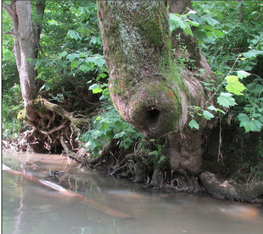
Fig. 1. Cavity in American Sycamore branch overhanging Whippoorwill Creek, Logan County, used by Northern Rough-winged Swallows for nesting during 2014.

On the afternoon of 11 June 2014, while wading down a stretch of Whippoorwill Creek in southwest Logan County, I observed a Northern Rough-winged Swallow ( Stelgidopteryx serripennis ) going in and out of a hollow underneath a bend in an overhanging branch of an American sycamore tree (Figs. 1 & 2). As I approached this tree, an adult perched nearby long enough for me to take its picture. Inside the eye level hole, I could see two young swallows. They retreated as far back as they could before my first camera flash. The hole appeared to go some distance back in the nearly horizontal trunk and continued upwards into the smaller vertical trunk above the bend.