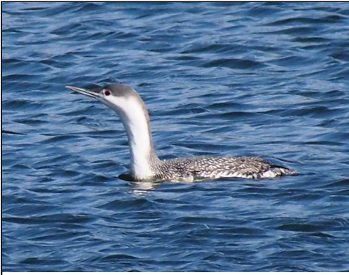
Red-throated Loon, Fayette 10 March 2014