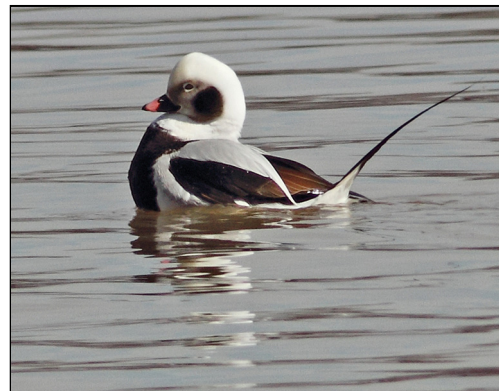
Long-tailed Duck, Jefferson 6 March 2014