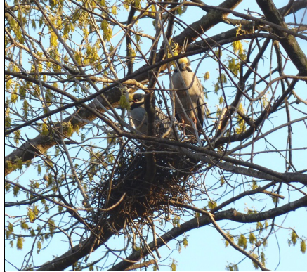
Yellow-crowned Night-Herons at nest Union, 18 April 2014