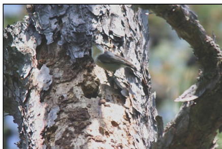
Brown-hd. Nuthatch at presumed nest cavity Marshall , 5 May 2014 Frank Renfrow

Brown-headed Nuthatch – birds continued at the nesting area at Ky Dam Village through the season (m. ob.) with excavation of a presumed nesting cavity noted there 5 May (FR).