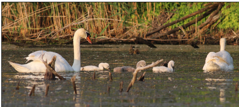
Mute Swan family, Muhlenberg 26 May 2014