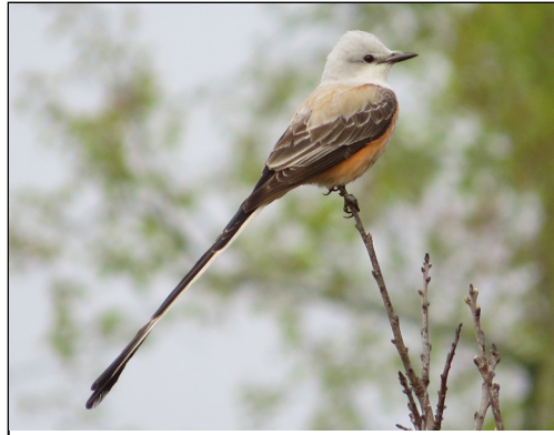
Scissor-tailed Flycatcher, Trigg 22 April 2014