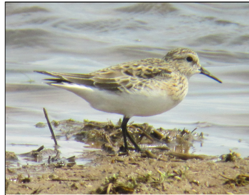
Baird's Sandpiper (1 of 2), Logan 31 March 2014