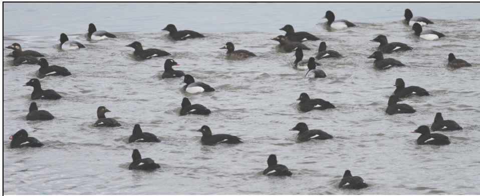
White-winged Scoters (nearly half of 61) w/ Greater Scaup, Bracken 6 March 2014 Brainard Palmer-Ball, Jr.

Long-tailed Duck – peak numbers actually occurred during March with the following reports: 1 on Owsley Fork Lake 1-7 March (ph. RF, RBa, GBo); 7 on the Ohio River at Louisville 1 March (m. ob.) with 16 total there 4 March (JBe, PB, et al.), 25 total there 6 March (EHu et al.), peak counts of 31 & 32 there 16 & 19 March, respectively (DSt et al.), 13 there 27 March (DSt), and 4 last reported there 1