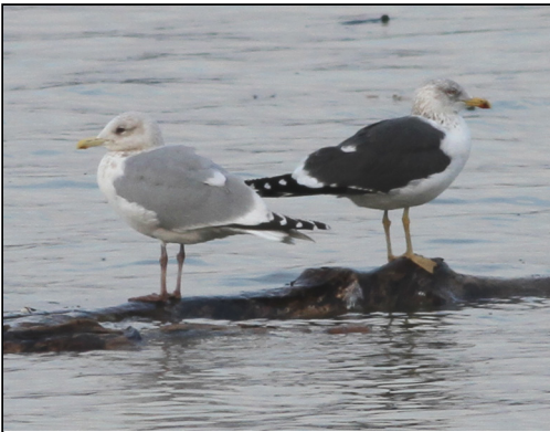
Thayer's Gull & Lesser Black-backed Gull, Gallatin 5 March 2014 Brainard Palmer-Ball, Jr.