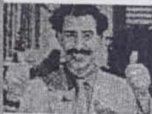
Borat Says: "If SGA does

accomplished all of its goals set at the retreat?