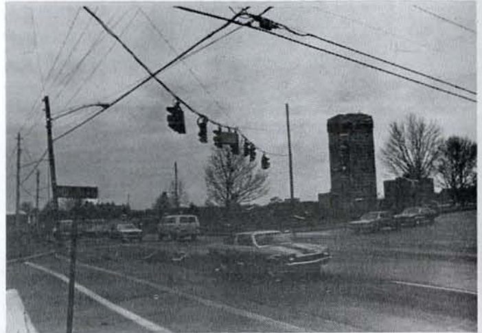
The stoplight that intersects Normal Drive and University Boulevard provides better traffic conditions for the university as well as the community.

The light will include traffic monitoring devices in the street so the light will only function when traffic warrants.