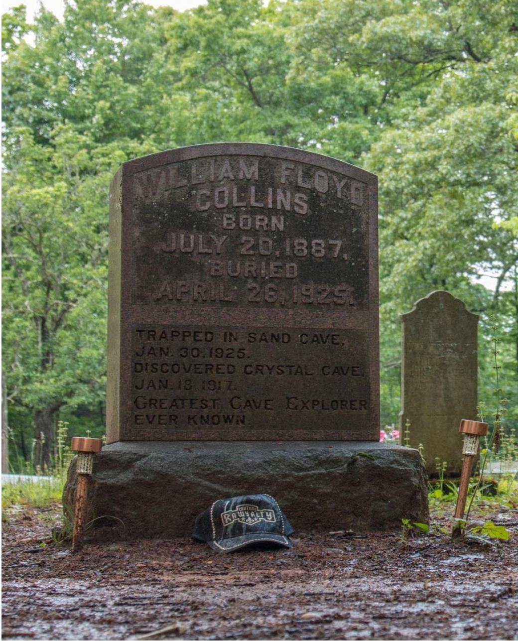
Figure 5.1: Collins's Final Resting Place