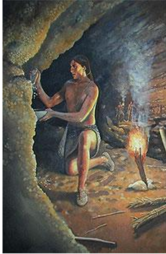
Figure 2.1: Illustration of a PaleoIndian Mining Minerals in Mammoth Cave