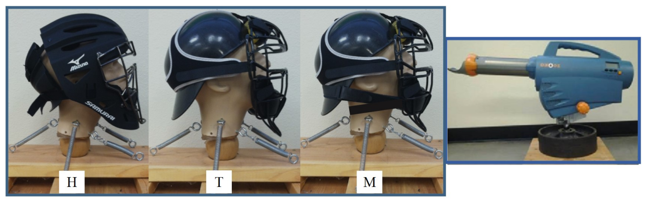
Figure 1 . Illustration of hockey (H), traditional (T), modified traditional (M) and pitching machine used in the project.

sophisticated projects incorporate a horizontal sled apparatus that does not allow any form of rotation response (18). It appears reasonable that any differences measured in the experiment could be attributed to the different equipment designs.