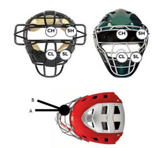
Figure 3. Ball/mask impact location and trajectory detail.