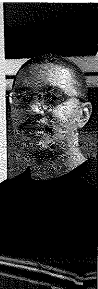
Exhibit Opening Reception: January 17 – 12:30 pm Kentucky Library and Museum, Western Kentucky University, Bowling Green, KY