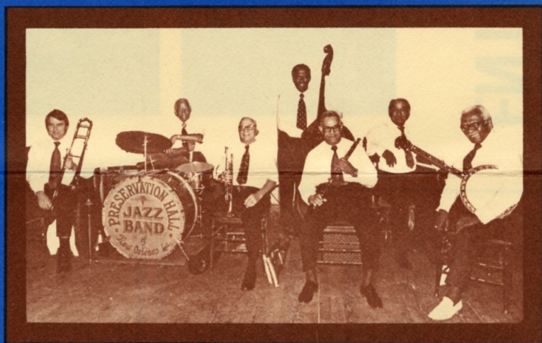
Preservation Hall Jazz Band February 23, 1978 Garrett Conference Center Ballroom

All performances begin at 8 p.m.; Admission: The Bill Monroe Show is Free; Other events: Students - $1; Others - $1 Advance, $2 at the door.