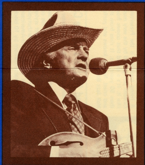
Bill Monroe and the Blue Grass Boys September 6, 1977 Ivan Wilson Center Outdoor Theatre