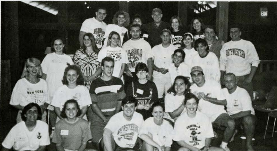
Weekend in the Woods Participants Gasper River Retreat October 1 - 2, 1994