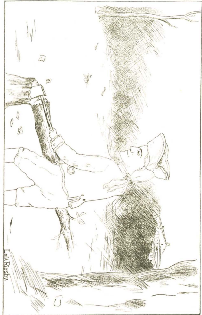
"And Georgie didn't tell a lie; he did it all with his little hatchet."

Mrs. Hayden turned abruptly, and passed from the room, leaving Celeste to fight a most desperate battle alone. Again she drew out the sheet of music and read the title, "The Call."