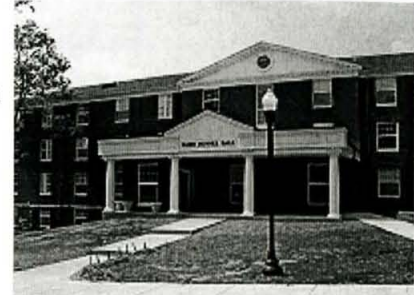
The newly-renovated Bates-Runner Hall reopened this fall as home to the Gateway Community, an academic learning community to actively engage students in their Western education.