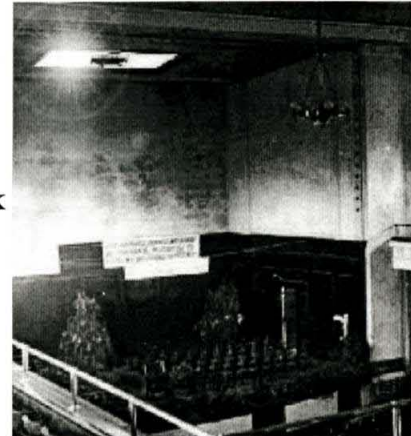
Was a "flying machine" over Van Meter Hall responsible for a Western ghost story?

The earliest and perhaps most mysterious airplane to appear on the Hill is part of a well-known campus ghost story. According to one of many versions, around 1910 a workman was perched near a skylight being constructed over the Van Meter Auditorium stage. Looking up, he was startled by the appearance of one of these still-novel flying contraptions, lost his balance, fell and was killed. During performances, a mysterious blood-red glow is said to appear on the stage where his body lay. Like all good ghost stories, his fate tells a cautionary tale: in this case, progress has the power both to delight and disorient.