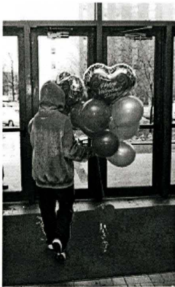
This year, you may be the lucky recipient of a Valentine's Day balloon bouquet.

Back by popular demand, the Count the Kisses promotion is going on in the Bookstore. While you're perusing the rest of the Valentine's Day selection, check out the jar full of Hershey's kisses. Fill out a form with your contact information and your guess at how many kisses are in the jar. Only one entry per person is allowed. The person who gets the closest to the correct amount wins a prize package. Last year's winner won: a large stuffed bear in a WKU t-shirt, dinner for two at Applebee's, two passes to the Great Escape movie theater and the entire jar of Hershey's kisses.