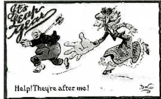
This 1912 postcard depicts a bachelor's anxiety during leap year.

Tradition, however, tells us that leap year creates even greater fears in the unmarried male. As Western Kentucky University's earliest student magazine, The Elevator , reminded readers in 1916, February 29 marks the year when "hopeful ladies are supposed to take bold steps," defy the rules of courtship, and propose marriage to the objects of their affection.