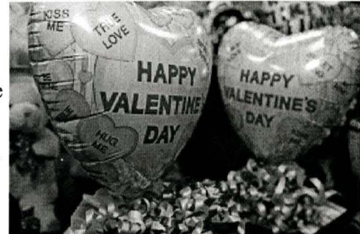
Trying to plan the perfect Valentine's Day? Start with a gift from the University Bookstore.

If you'd like one of each, the Bookstore has prepackaged Valentine arrangements, which range in price from $6.25 to $10.95. Balloon bouquets, always a popular choice in the past, cost $8.99 and are also available for free delivery. This year the Bookstore is also carrying silk and perfume roses for $2.95 each.