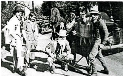
Sadie Hawkins Day at the Bowling Green Business University, about 1950.

In 1937, cartoonist Al Capp added a distinctly American flavor to the leap year tradition. On Nov. 15, readers of the comic strip "L'il Abner" learned of the predicament of Sadie Hawkins, severely challenged in the matter of physical beauty and, accordingly, unable to attract a husband. The next day, her father lined up the local bachelors, and with a shot from his pistol, sent them running. Another shot sent Sadie in pursuit of the slowest among them, who, when caught, was obliged to take her hand in marriage.