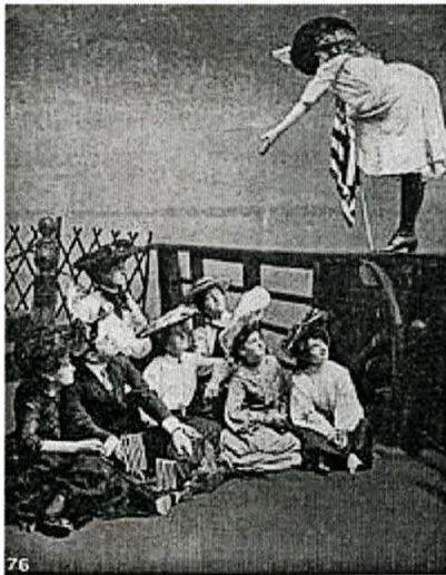
"Don't Let a Chance Slip Girls— This is Leap Year"