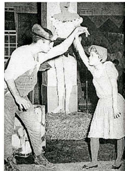
Tickets for Western's 1959 Sadie Hawkins Dance could be purchased from any member of the junior class.

I have just one chance, this much is clear, Whisper to her it is now leap year.