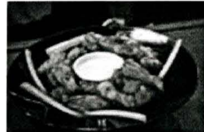
Red Zone offers several appetizers, including hot wings to enjoy while watching the game.

“The best thing about the Red Zone is the atmosphere,” said Chad Hilton, who tends the non-alcoholic bar. “It gives everyone an escape from the normalness of the rest of the food court.”