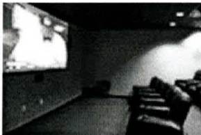
The theater room offers 19 plush reclining chairs and a 123-inch projection television.

Faculty, staff and alumni donated most of the WKU sports memorabilia that makes up the décor of the restaurant, and the red banners that used to hang in Diddle Arena have found a new home in the Red Zone.