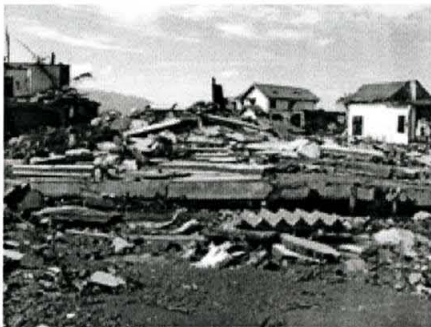
Remains of Nikoya Radio, one of Banda Aceh's most successful radio stations.