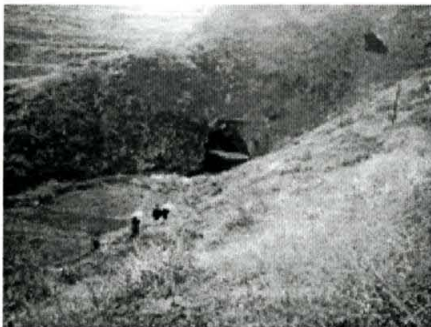
Chinese scientists undertake a reconnaissance of Coffin Cave, western Hunan. A WKU team returned to explore and map the cave, finding deep vertical shafts within.