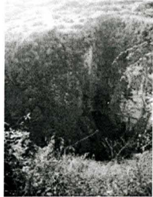
A joint WKU/Chinese team is currently in China exploring and mapping Songjia Dong, or Song Family Cave, in eastern Hunan.