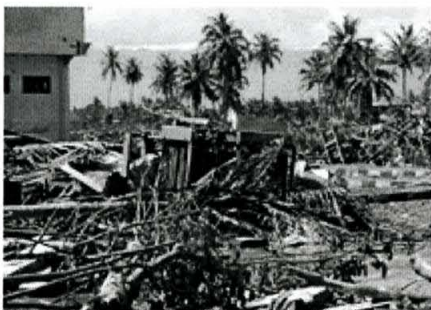
Serambi's printing press, which was bolted to a cement floor, was launched more than 30 meters from the building by the tsunami.

“We can’t forget Indonesia. I have read that the real tsunami in Indonesia is not necessarily the tidal wave, but the corrupt system that they have and the fact that they need to get caught up with the rest of the world in terms of technology and freedom and civil rights,” Bretz said.