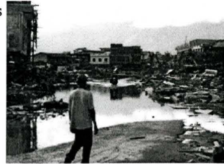
Devastation in an area of Banda Aceh that is about 3 km from the ocean. Roads in Banda Aceh are still being cleared and running water is still only sporadically available in various parts of the city. It is the rainy season in Indonesia, so large downpours and flooding are hampering recovery efforts.

“It's a very tightly controlled political situation. You had to be