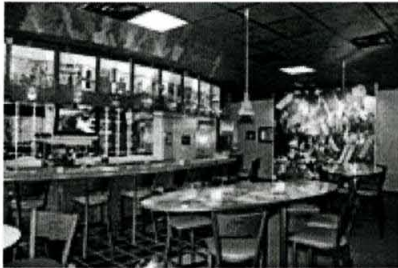
At the bar, you can enjoy a smoothie and other drinks, but no alcohol is served.

The Red Zone opened last September in Downing University Center, and it's a nice lunch break right on campus.