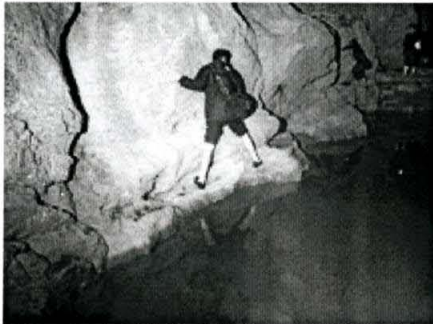
Chinese scientists try to avoid a swim in Thunder Cave.

The Chinese contacted the WKU group with a request to organize an expedition to explore and map side passages in the cave that have not been completely explored, as well as other nearby caves that might connect to Wanhuayan.