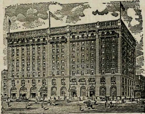
The Seelbach Hotel Corner Fourth and Walnut Streets.

The Cherry Club Banquet will be held in the auditorium located on the tenth story of the Seelbach Hotel from 5:00 p. m. to 8:00 p. m., Friday, April 27, 1917. A large number of former students are already ordering their tickets. The attendance will be very large, and the occasion one of the greatest ever held in the State. A feast of music, oratory and good things to eat, has been arranged by the members of the Cherry Club. All former students of the Old Southern Normal and the Western Kentucky State Normal are urged to attend. Persons desiring tickets are earnestly requested to send a dollar to either Mr. Guy Whitehead, care Y. M. C. A., Louisville, Kentucky, or Mr. O. G. Byrn, care Western Kentucky State Normal, Bowling Green, Kentucky, and ask for a ticket. It looks at this writing as though the attendance will exceed the capacity of the great banquet hall that has been engaged for this purpose. The banquet will close in time to give everyone an opportunity to attend the evening session of the K. E. A. or the programs offered at the theaters. The Seelbach is located on the corner of Fourth and Walnut Streets.