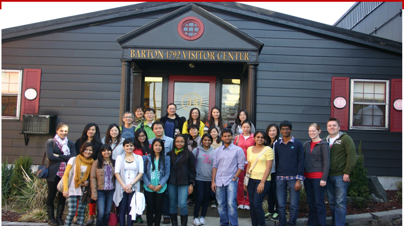
WKU staff and international students at 1792 Barton Distillery in Bardstown, KY