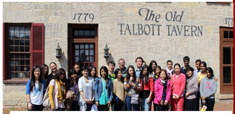
WKU staff and international students at The Old Talbott Tavern in Bardstown, KY

April 6 th , a group of 28 students and scholars traveled to Bardstown, KY to tour the 1792 Barton Distillery to see the entire bourbon making process. They enjoyed lunch in the historical Talbott Tavern and then journeyed to Harrodsburg, KY to visit the Pleasant Hill Shaker Village. At Pleasant Hill Shaker Village, the students were transported back in time to glimpse the lifestyle of the Shakers in this 19 th century Kentucky communal village. While touring the grounds and buildings, they learned about the Shakers' unique religion, culture and lifestyle.