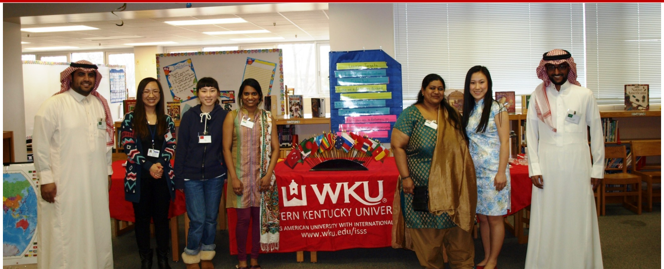
International students/scholars volunteer at Lost River Elementary School International Night

LOST RIVER ELEMENTARY SCHOOL - On March 26 th , WKU students and scholars from China, India and Saudi Arabia dressed in their traditional clothing and volunteered their time to share their cultures with the children of this elementary school. Smiles abounded as the WKU students and scholars wrote the children's names in Arabic, Chinese, Hindi and Telugu.