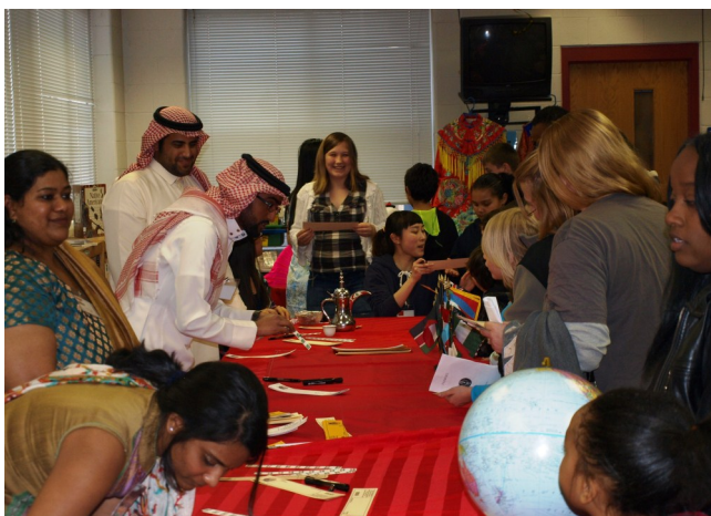
International students/scholars volunteer at Lost River Elementary School International Night