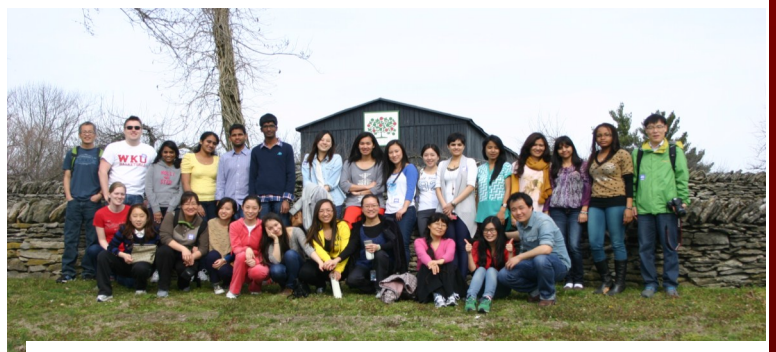
WKU staff and international students at Pleasant Hill Shaker Village in Harrodsburg, KY