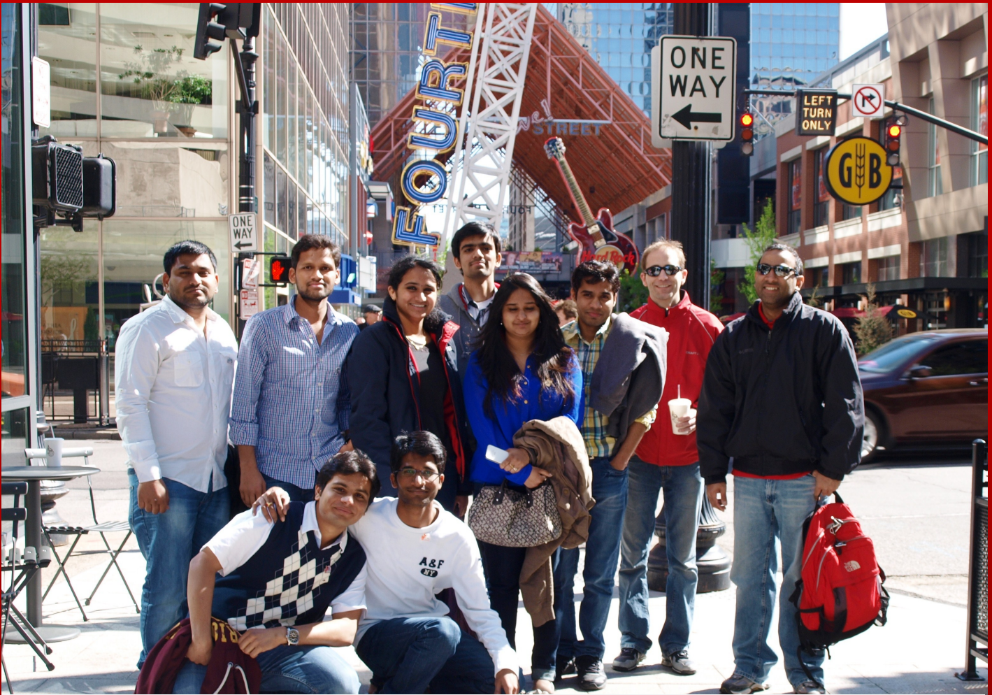
WKU staff and international students at Thunder Over Louisville

THUNDER OVER LOUISVILLE – On April 20 th , ISSS took a group of 28 students to Thunder Over Louisville to enjoy the kickoff event of the Kentucky Derby Festival. This event is rated as one of the top 100 events in North America. Thunder Over Louisville showcases a spectacular airshow and the largest annual fireworks display in North America. The group enjoyed exploring downtown Louisville and sharing in the festivities of the event..