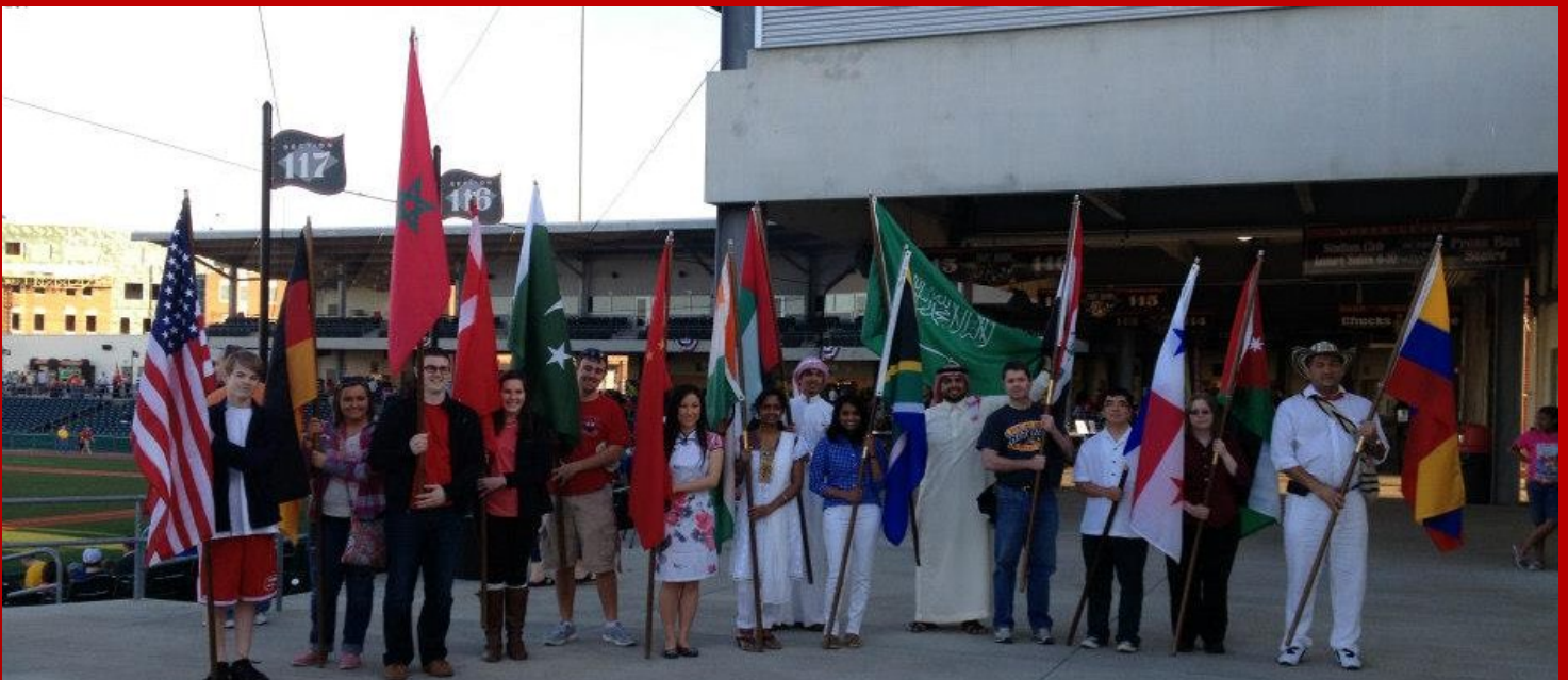
WKU volunteers for international parade at Bowling Green Hot Rods Game