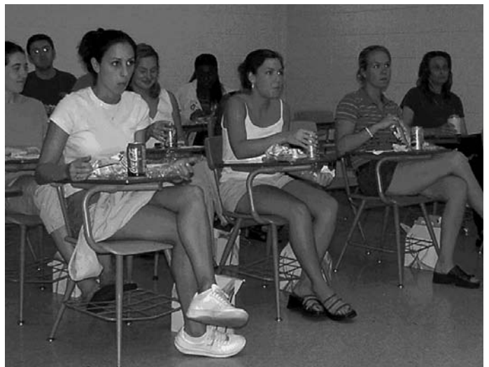
REU interns enjoy their lunch while attending a Brown Bag Seminar