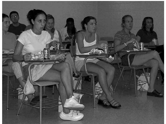
REU interns enjoy their lunch while attending a Brown Bag Seminar