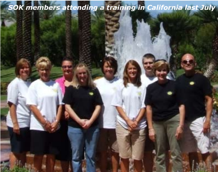
SOK members attending a training in California last July

The Save Our Kids Coalition (SOK) began in 2003 when a group of concerned citizens organized themselves to address the drug issues in Warren County. In order to expand their capacity, SOK became a nonprofit organization in the spring of 2006, and they hired their first Executive Director by that Fall.