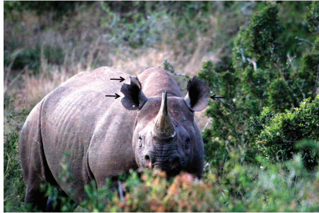
Figure 1. Photograph of an adult male black rhinoceros in the Nyathi section of Addo Elephant National Park, South Africa. Individuals can be identified by distinct anatomical features and a specific pattern of ear notches (black arrows).