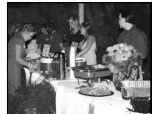
One of the highlights of Spirits in the Cave is the extensive food show.

where patrons savor tasty samples from many local restaurants, as well as sip wine, beer and sodas from local distributors. While enjoying the delicious cuisines and beverages, patrons can enjoy the live music from popular band Exit 4. The event also includes a substantial silent auction which features something for everyone.