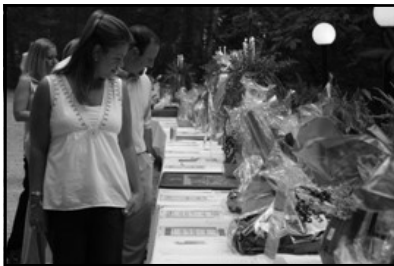
Silent Auction table at the 2005 Spirits in the Cave

Big Brothers Big Sisters of South Central Kentucky is a private, nonprofit organization with a portion of its funding coming from United Way of Southern Kentucky, various grants, and private donations. The remainder of funding is generated through other fundraising efforts such as Bowl For Kids' Sake, which occurs annually in late February, and also their summer fundraiser, Spirits in the Cave. The fifth annual Spirits in the Cave will take place Thursday, July 27 th , from 6:00 to 9:30 p.m. at picturesque Lost River Cave in Bowling Green. The event features an extensive food show,