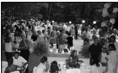
Patrons enjoying the festivities at last year's Spirit in the Cave

While BBBS is currently in the planning stages of Spirits in the Cave, they are eager to hear from anyone interested in sponsoring this event, making a donation to the silent auction, inquiring about being a vendor, or requesting ticket information. Tickets are $25 per person and will be available for purchase in early July.