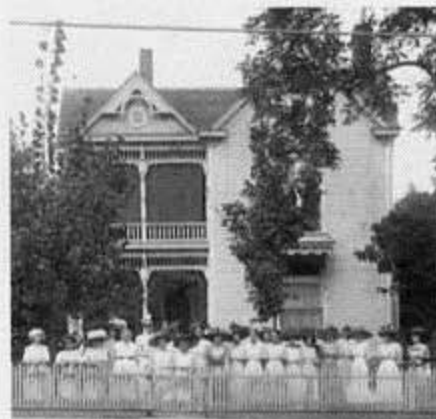
Women's clubs such as the Ladies' Literary Club helped start libraries across the country.

As Bowling Green grew, it reveled in its reputation as the educational center for south central Kentucky, but it still had no library easily accessible to the public. Well-to-do folks purchased books and popular periodicals in town at T.J. Smith's Book Store or Garvin's Store, and they surely circulated these among their friends. Even children of these