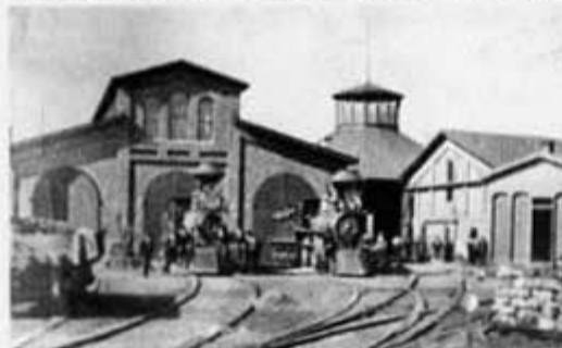
The L&N Railroad helped link Bowling Green to the outside world.

Although never abandoned, Warren County's early intellectual development was stalled by its concentration on economic survival. Bowling Green emerged as the transportation and commercial center for Warren County and several contiguous counties. Flatboats laden with the produce of a fecund countryside left the Bowling Green area annually in the late spring to points southward. The Barren River was made navigable for steamboats by a series of locks as early as 1842. These cargo and passenger carriers departed from Bowling Green for Louisville and Evansville via the Barren, Green and Ohio Rivers. Upon the completion