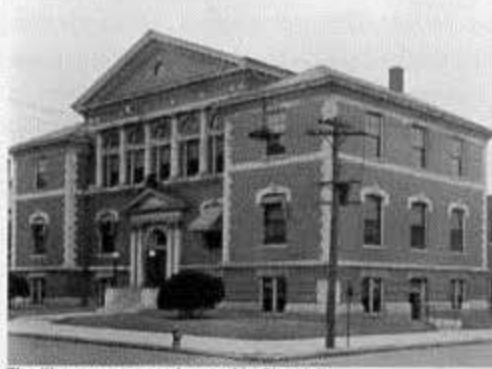
The library was once located in City Hall.

When the new City Hall was completed in 1908, a room was dedicated for the library. Soon the women began to find maintenance and operation of the library "burdensome." In 1913 the library committee proposed donating the collection to Western Kentucky State Normal School, but the Current Topic Club opposed this plan. The