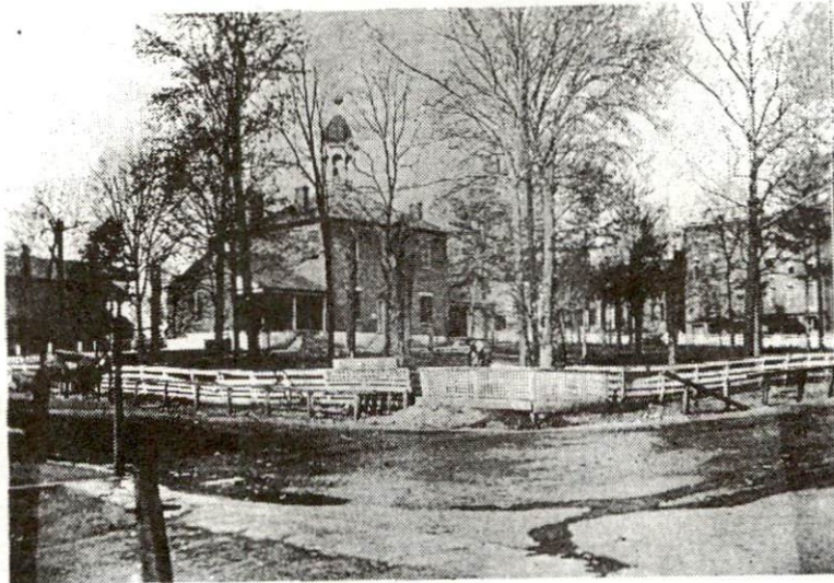
Barren County Courthouse - 1881