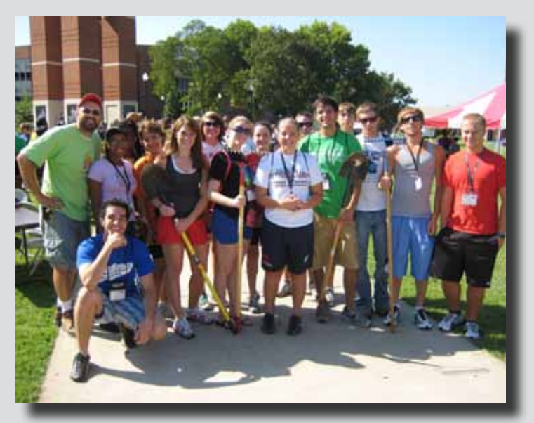
At Big Red's Blitz in 2010, students selected one of 22 different project sites to volunteer. Featured above, students prepare to volunteer with Habitat for Humanity building homes.

The 2011 Big Red's Blitz will take place on August 25th. For information on serving as a project site for Big Red's Blitz, contact Aurelia Spaulding at (270)-782-0082 or aurelia.spaulding@wku.edu.