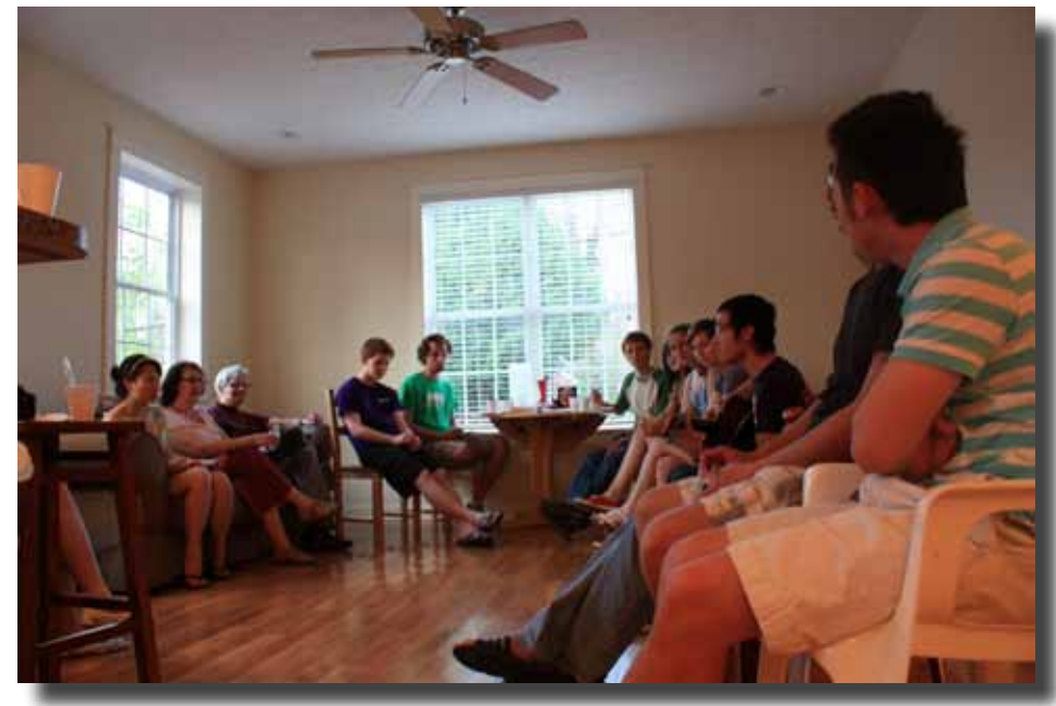
Hill House students host Sunday dinners each month for the community. Featured above, students communicate during the Vietnamese-themed Sunday dinner.

Graduate student Mo Zhang's research on utilizing self-disclosure to build neighborhood trust not only served as a community-based research project but a great tool for future Hill House students.