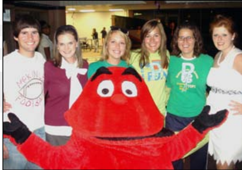
Honors Club students party with Big Red at the Honors Club Halloween Bash. Story Page 2