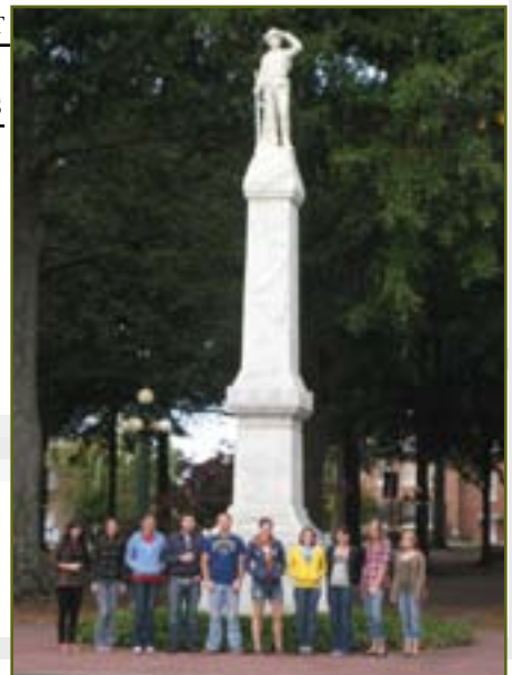
Story Page 4

The Honors Hemingway and Faulkner class visited many influential sites about William Faulkner and Ernest Hemingway