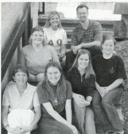
American Choral Directors Association