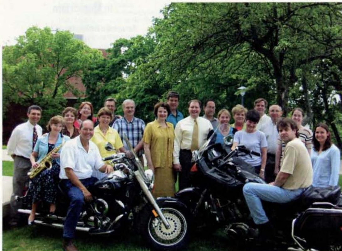
2003-2004 Music Faculty