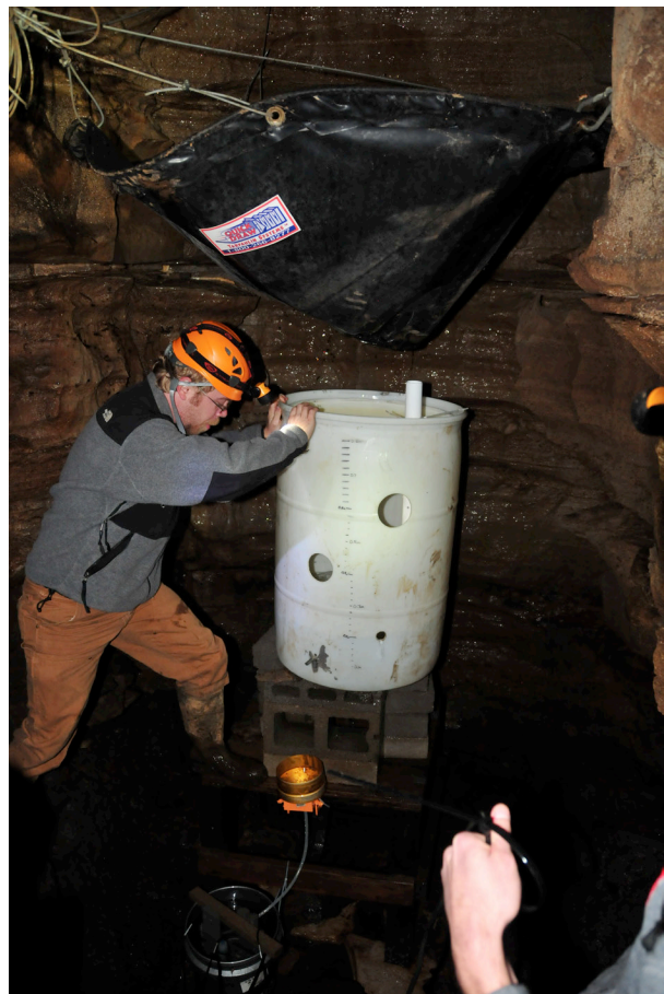
Figure 6. Barrel-shaped weir at Waterfall One in Crumps Cave for discharge measurements. Water level is measured with a pressure transducer in the barrel and the temperature, pH and spC probes are in the bucket below.

We have used least-squares regression analysis to relate specific conductivity data to calcium, magnesium,