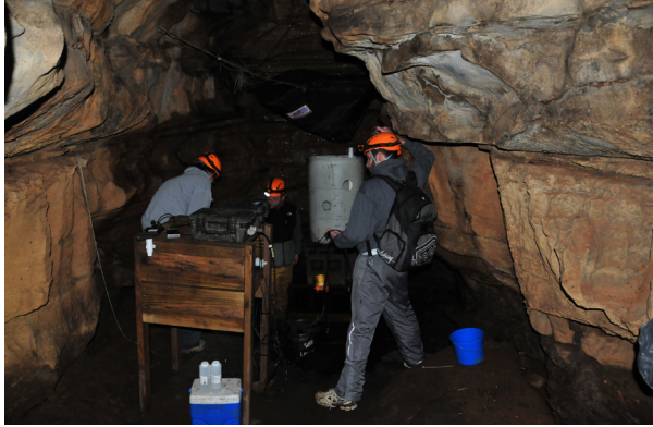
Figure 5. Epikarst monitoring site at Crumps Cave.

level is measured every ten minutes with a pressure transducer, and appropriate relationships are used to calculate discharge in liters per second as a function of water level. Water exiting the weir flows past duplicate temperature and specific conductance (spC) probes and triplicate pH electrodes. These observations are recorded every ten minutes on duplicate Campbell Scientific multichannel data loggers (that is, each logger records temperature, spC and a pH; one logger has a second pH probe and one has the weir pressure transducer). Multiple equipment design is used for three reasons: 1) redundancy minimizes data loss in case of any component failure, 2) comparison of independent, multiple readings provides a measure of data quality, and 3) in cases of potentially unexpected behavior of any parameter, multiple probes behaving in the same way ensure that the signals reflect actual flow system behavior rather than electronic artifacts. Water samples for lab analysis are taken by duplicate automatic water samplers each with 24 bottles, which when utilized are programmed with eight-hour resolution but staggered so one or the other sampler takes a one liter sample every four hours. This allows for four-hour resolution but lets the samplers run for eight days before filling all bottles, and also provides redundancy in case any component of the samplers malfunctions.