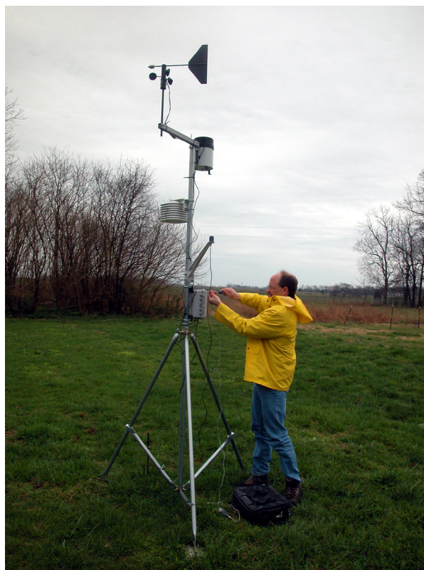
Figure 4. Weather station above Crumps Cave.

Soil temperature data for 5, 10, 25, 50 and 100 cm depths are measured with 30 minute resolution at two nearby research-grade climate monitoring stations that make up part of the Kentucky Mesonet network, including the Warren County and Barren County stations that lie about 18 km west south west and 18 km east south east of the Preserve, respectively. Comparison of the data from the two sites indicates that over the one year of 30-minute resolution data the average difference between the 87,600 readings comparing paired measurements taken at the same depths and times was less than 1°C. Comparison of these data thus suggest that seasonal and diurnal variations between the two sites, and thus those in the soil at the preserve, are nearly identical, though timing of temperature variations on the scale of minutes to hours can be larger due to local conditions. Local differences between soil moisture conditions at the two Mesonet stations are greater, and our use of these data herein is limited to interpretation of relative changes (whether soil moisture is increasing or decreasing over some period, for example) when both stations are in agreement.