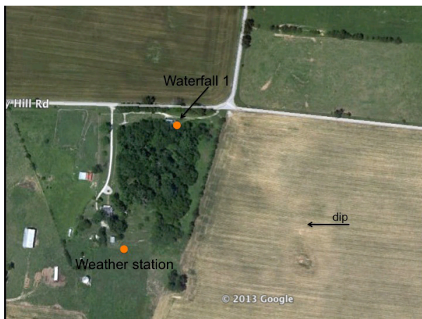
Figure 3. Crumps Cave Preserve covers the ~one hectare area of the wooded sinkhole (image from Google Earth).

The site is located at latitude 37.1oN with a surface altitude of 194 m above sea level. The climate here is humid subtropical (Köppen-Geiger Cfa) (Peel et al., 2007). Five long-term weather observation stations located with 35 km of the Preserve and all within less than 50 m elevation have a mean annual precipitation of 1,300 mm and temperature of 14.7oC (Kentucky Climate Center, 2012). Precipitation is spread approximately evenly across the year, though late spring tends to be a bit wetter, and fall a bit drier, than other times of the year. Hess (1974) estimated that mean-annual potential evaporation is 800 mm, varying from near zero to over 100 mm/mo.