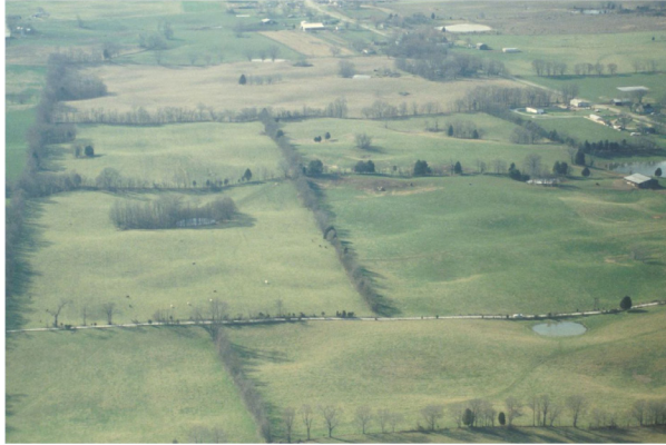
Figure 1. Pennyroyal Plateau sinkhole plain, south central Kentucky, typical of the area near Crumps Cave.