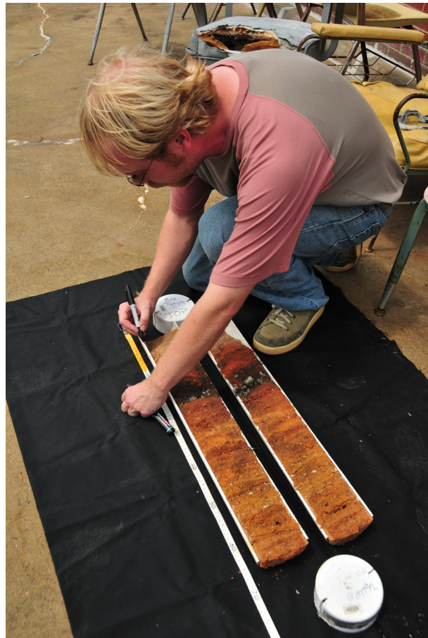
Figure 3. Cutting and processing of sediment cores for carbon isotope analysis.

In Gales Point, as well as in Orange Walk and Corozal in the north, we are working to study the effects of these climatic changes and karst groundwater issues on the community and their perception of water treatment efforts and availability. This is being completed using participatory needs assessments, water quality studies monitoring fecal coliform bacteria on a monthly basis, and an isotope hydrology study to determine storm variability, recharge characteristics, and groundwater flow patterns. The research includes community assessments regarding water resources, karst landscapes, and sustainability knowledge. It also entails methods to survey, delineate, and assess karst groundwater