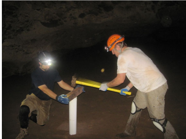
Figure 2. Collecting sediment cores from Box Tunich Cave.

on these core samples involves analyzing the sediments for \delta^{13}\text{C} data to understand land use change from past human-environmental interactions. A driving hypothesis is that the location of these Maya population centers were the first to be susceptible to increasing drought and environmental degradation because of the nature of the highly-drained, thinly mantled karst topography, leading to issues with access to water for agricultural purposes.