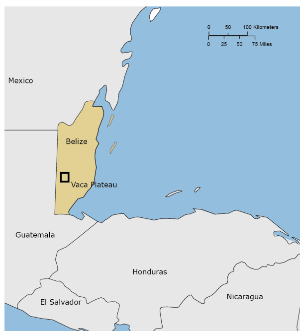
Figure 1. Map of study area.

Recent studies have sought to better understand the socio-environmental dynamics of the Maya civilization in Belize, and since 2004 research in the north Vaca Plateau has focused on using geological proxies for reconstructing local and regional paleoenvironmental conditions. Since 2007, studies using cave deposits from the Vaca Plateau have proven to be effective in delineating periods of climatic and land use change sequences that help explain the waning of the Maya population in the area (Polk et al. 2007). To further refine the paleoenvironmental information that is already known about the study area, several lines of investigation were initiated in 2010 involving geoarchaeological field reconnaissance, and sampling of cave sediments and carbonate deposits to compliment the developing archaeological record. The primary research area focuses on the Minanha and Lower Dover archaeological sites. During two field seasons (2010, 2012), eight sediment core samples from caves in the study area near the Lower Dover and Minanha sites were collected (Figure 2, 3). Currently, processing of the new sediment cores is underway for radiocarbon dating, with a focus on establishing a chronology of up to 3000 years. Work