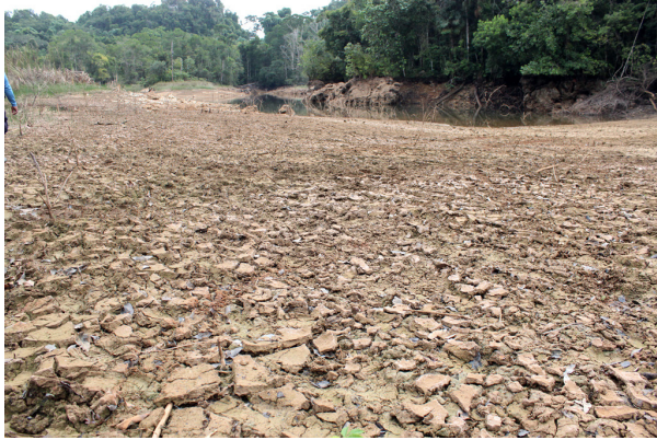
Figure 6. Five Blues Lake, located in central Belize, which is a karst feature that drained in a matter of days in 2012, and has done so several times. It serves as the nearby village's water supply.

estimate for the vulnerable karst regions of the country of Belize. This can then be updated periodically as data are collected and technology and training are improved.