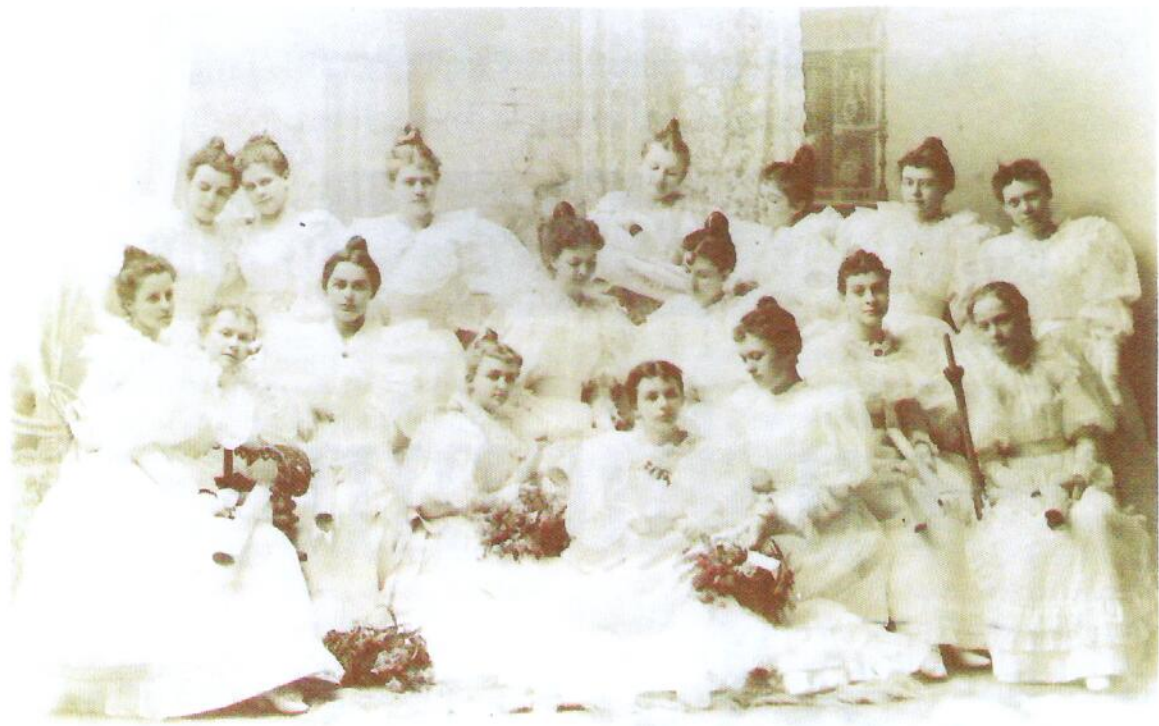
Potter College: The students of the Pleasant J. Potter College for Young Women were a marketing boon for the Taylor Company, which they continued to patronize after they returned to their homes throughout the South and Southwest.