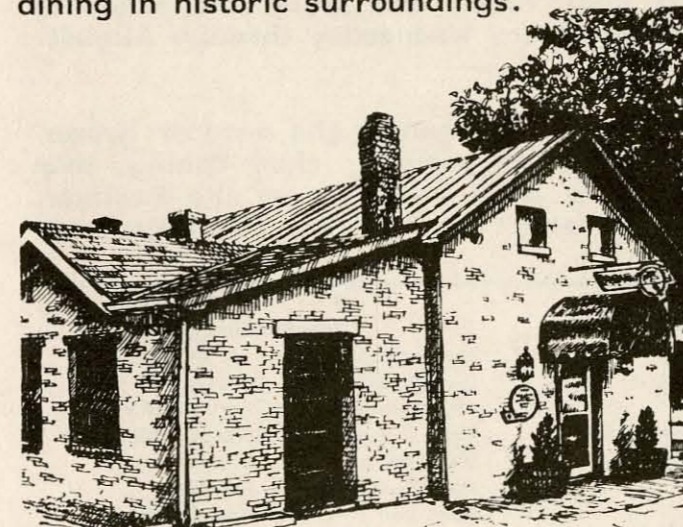
THE PARAKEET CAFE

Dining in Historic Kentucky , a book of famous restaurants in historic buildings around the state, includes Bowling Green's Parakeet Cafe. Lexington author, Marty Godbey wrote the book as a restaurant guide for those who enjoy dining in historic surroundings.