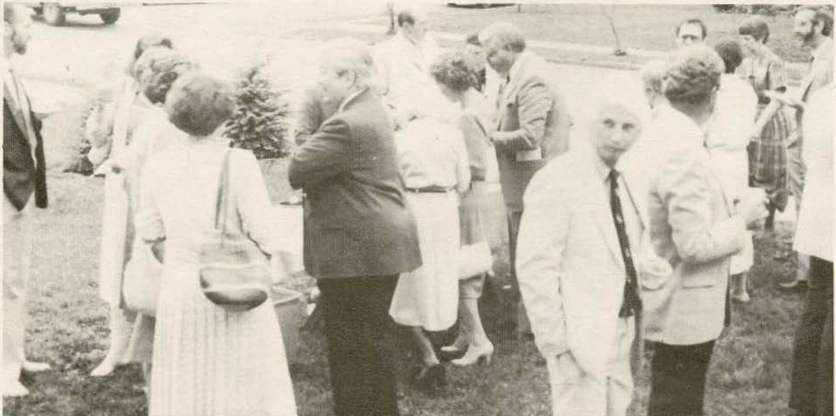
Part of the crowd of over 100 enjoying the reception at the Decorator Show House prior to the Landmark Annual Dinner.