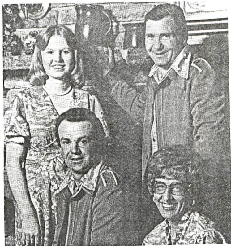
The Steps Of Faith